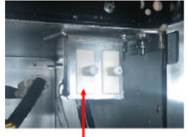
Supplies power to both X & Y motors

7. Pull the top left (white) door switch in the out position to power the XY Motors.